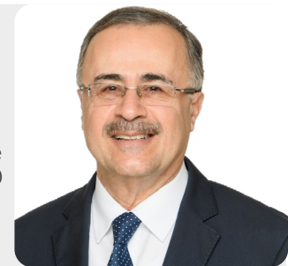
Amin H. Nasser President and CEO

"These are exciting times for Aramco as we continue to seek new opportunities to enhance our portfolio and our capabilities to enable a secure and more sustainable energy future."